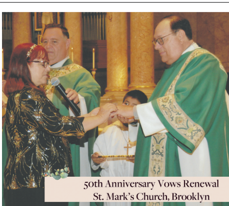
50th Anniversary Vows Renewal St. Mark's Church, Brooklyn