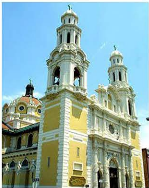
Saint Barbara R.C. Church, Bushwick-Ridgewood