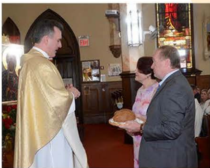
Our Lady of Czestochowa-Saint Casimir R.C. Church, Greenwood

Number of Pledges Percentage Reached Goal 62 100%