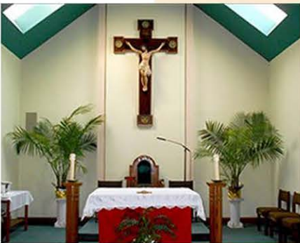
Our Lady of Miracles R.C. Church, Canarsie

Over goal funds: ongoing repair and maintenance of the church boiler